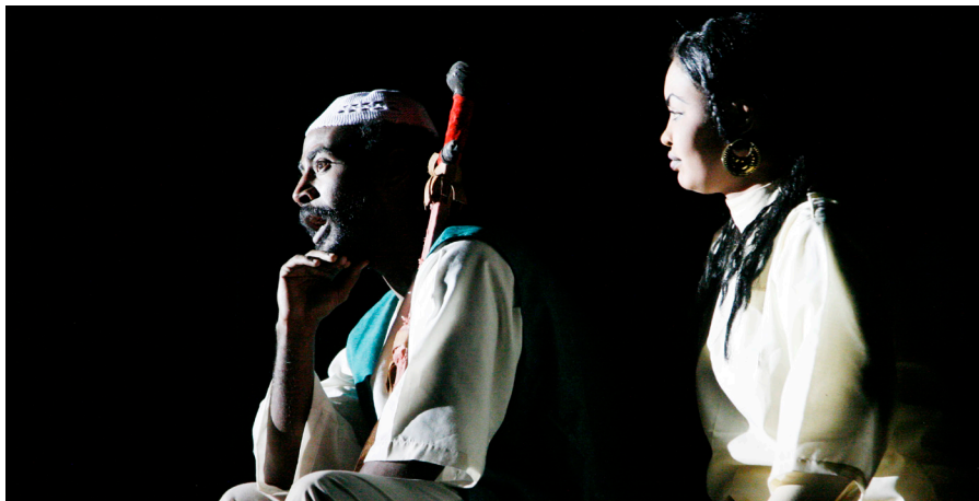
ITI Sudan Centre 2016

Due to the multitude of languages that exist all over the world, and because the Message should be understood by the people in a country or region, the Message of World Theatre Day is always translated into the country's language or languages and the same goes for the short biography of the author.