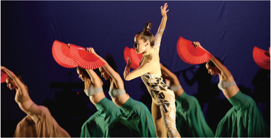
Ella y él... siempre by the Lize Alfonso Dance Cuba. International Dance Day 2018 in Havana, Cuba

The International Theatre Institute ITI created through its Dance Committee also International Dance Day.