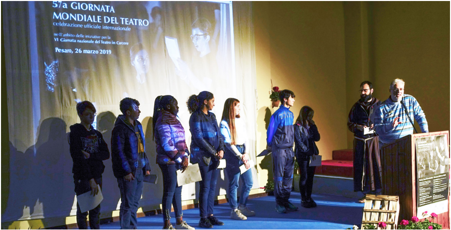
World Theatre Day 2019 in Pesaro, Italy