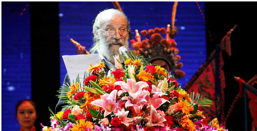
Anatoly VASILIEV, World Theatre Day 2016 in Guangzhou, China