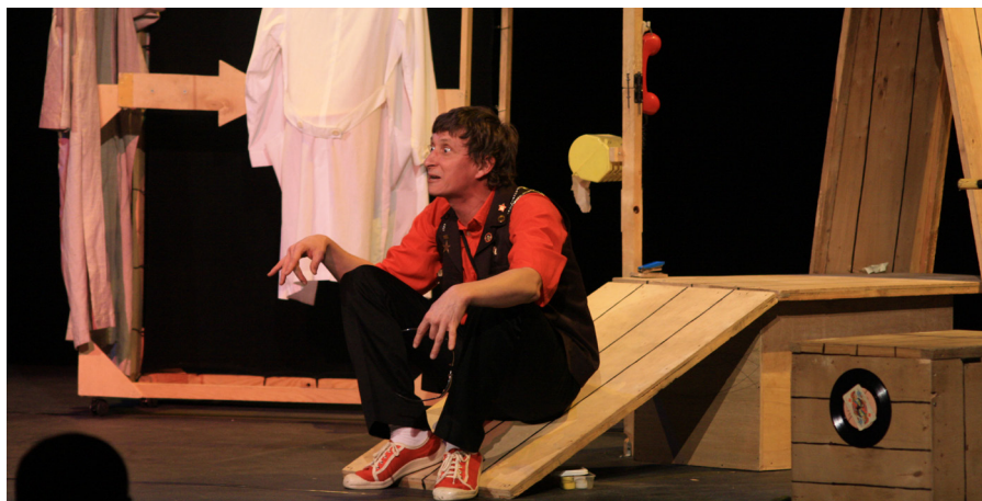
International Theatre Institute (ITI event in 2010)