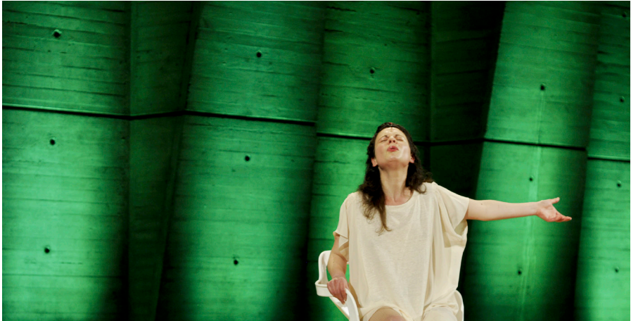
World Theatre Day 2012 in Paris, France

The main issue of World Theatre Day is to promote “theatre” in all its forms to professional and people all over the world. Further goals and purposes include: