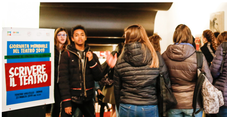
Ceremony "Scrivere il Teatro", World Theatre Day 2019 in Rome, Italy