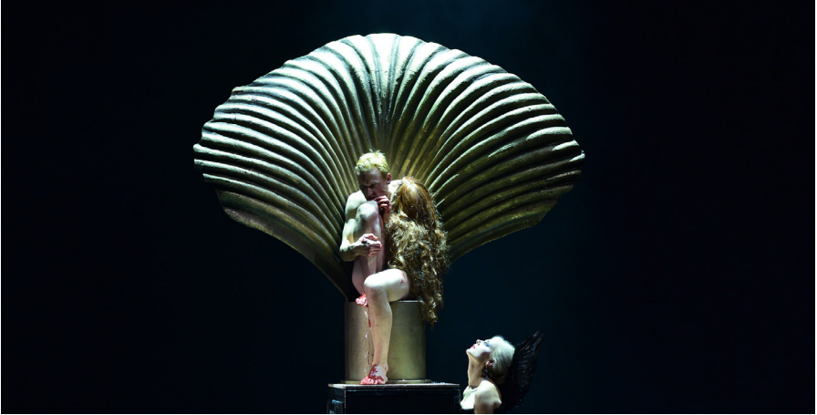
International Theatre Institute

World Theatre Day has been created by the International Theatre Institute ITI, the world's largest organization for the Performing Arts, and was celebrated for the first time on 27 March 1962.