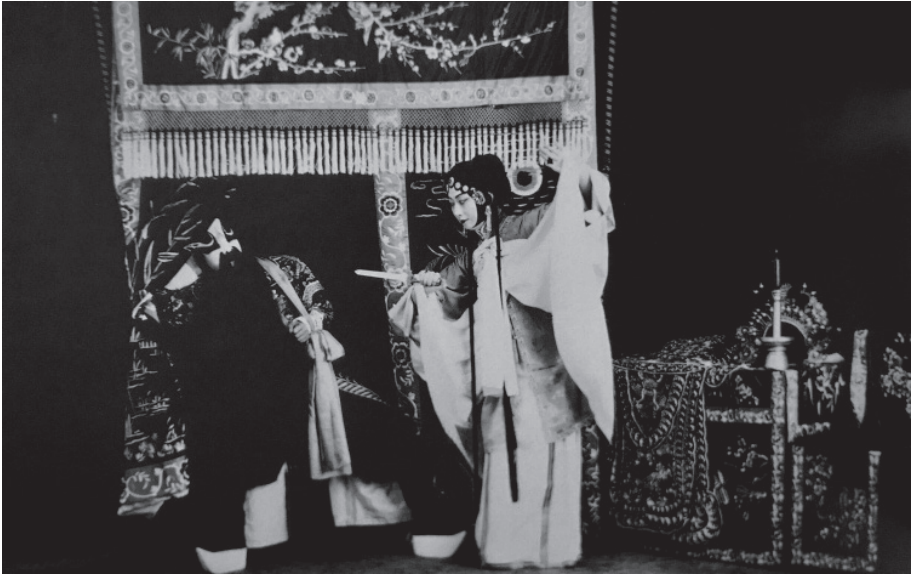
■ A scene of Mei Lanfang and Cheng Yanqiu's Stab Tiger