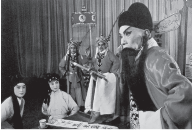
■ A court scene of the Kunqu Fifteen Strings of Coins

the show. He pointed out, based on the story, that bureaucratism in collusion with subjectivism was the biggest enemy of realism. Mao Zedong considered Fifteen Strings of Coins as a fable of great educational significance. The complicated case story in the Ming Dynasty broke the limitation of time and space, becoming an important part of the public discourses then.