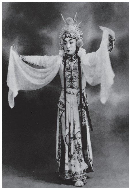
■ A scene of Shang Xiaoyun's Jinshan Temple ; A scene of Xun Huisheng's Meilong Town

Then where did the term Dan come from? Back in the Han Dynasty, many foreign words began to be used in Chinese society. The word “dance” widely used then in the Western Regions was transliterated as “Dan” in Chinese. The term “Hu Dan” often used then, means female dancers from the Western Regions. During the Tang and Song Dynasties, the word “Dan” was often used to refer to dancers or performers. Since dancing was mostly dominated by women since ancient times, “Dan” gradually became a name for women. When Xiqu began to favor story telling and characterization, it began to use