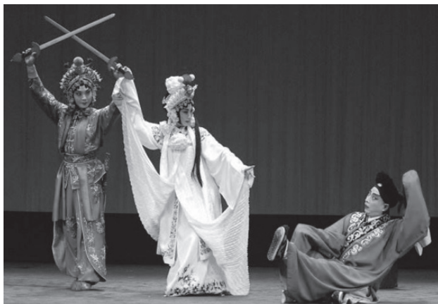
■ The Scene of “The Broken Bridge” of the Jingju Tale of the White Snake

made it relevant to the most extensive base of viewers, the story’s legendary association and realistic quality are most effectively unified; and its concentration on a single conflict is a radical structural innovation. Its stage production is equally classic: it is “game-changing” because older staging mode emphasized apparent acting skill showing-off at the cost of storytelling and characterization, while this production portrays vivid characters and expresses their inner selves; it stresses thematic coherence and representation effectiveness instead of drawing special attention to individual actors’ vocal or physical dexterity; it pays scrupulous attention to the tiniest detail, in sharp contrast to the older mode where some “external details” seemingly never mattered. In a sense, the production of Tale of the White Snake marked an aesthetic shift in Jingju. As a classic, Tale of the White Snake has continually aroused its audiences, aesthetically, and generation after generation.