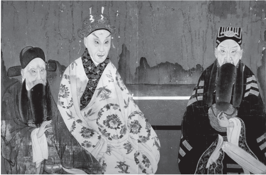
■ Portrayal of Cheng Changgeng

plays, characterizing vivacious and unmarried young women on stage. Therefore, there were still risqué elements in the early performances of the Hui Troupe. However, due to policy changes enacted by the later Qing Dynasty, the tunes sung by the Sanqing Troupe, including Luantan (literally sensational instrument playing), Bangzi (literally clappers), and Xiansuo (literally strings), were banned, thus bringing a crisis to the survival and development of the troupe. Fortunately, the Sanqing Troupe was able to adapt to the policy changes.