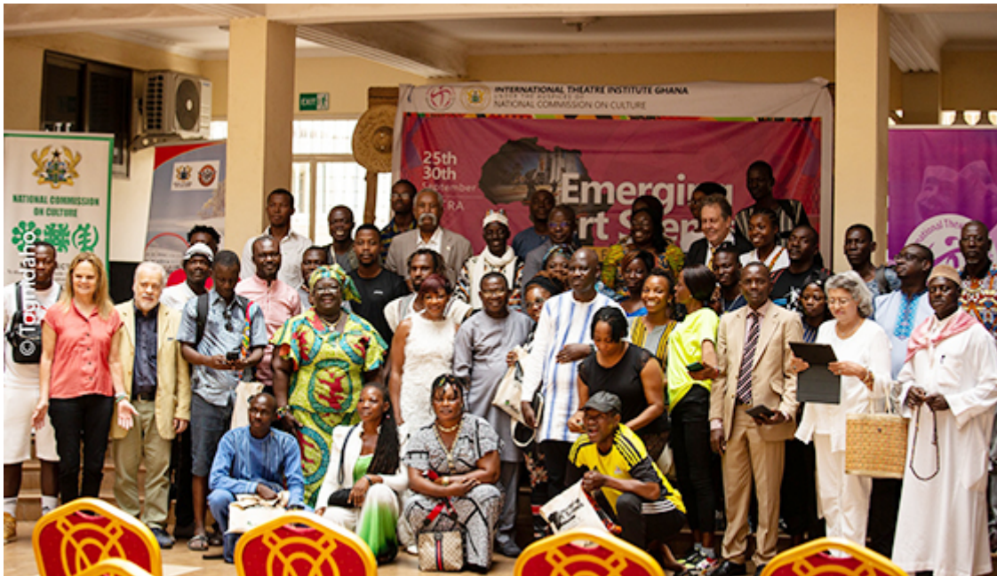
Picture of the Opening of the Emerging Scenes in Africa, in Ghana