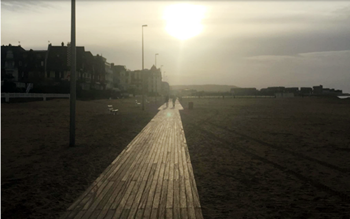
taken in December 2021