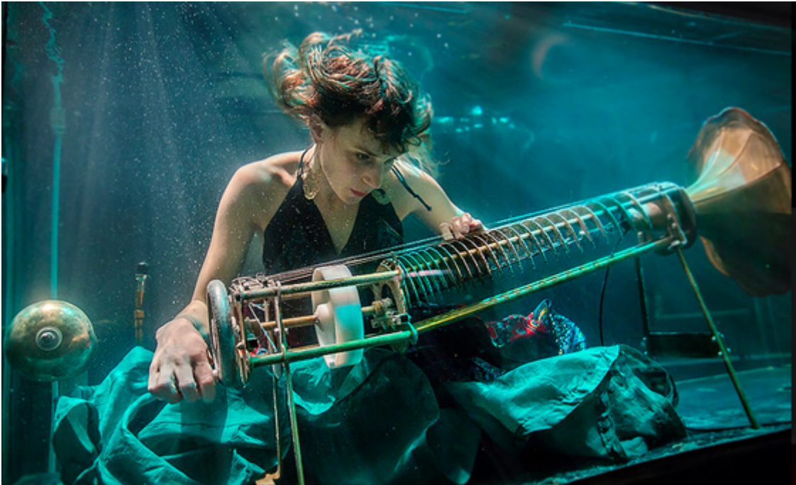
"Aquasonic Live" by Between Music: One of the awardees of the Competition 2018.