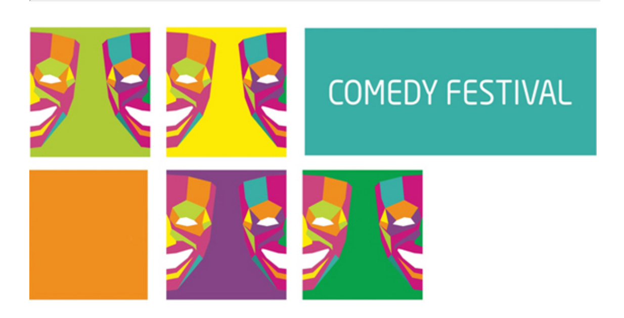
Georgian Centre of ITI – Call for Participation in the Comedy Festival in Gori 6 to 12 June 2020 (organised as an openair festival with videos)