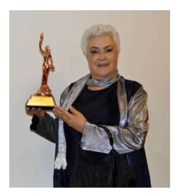
President of the ITI Mexican Center.