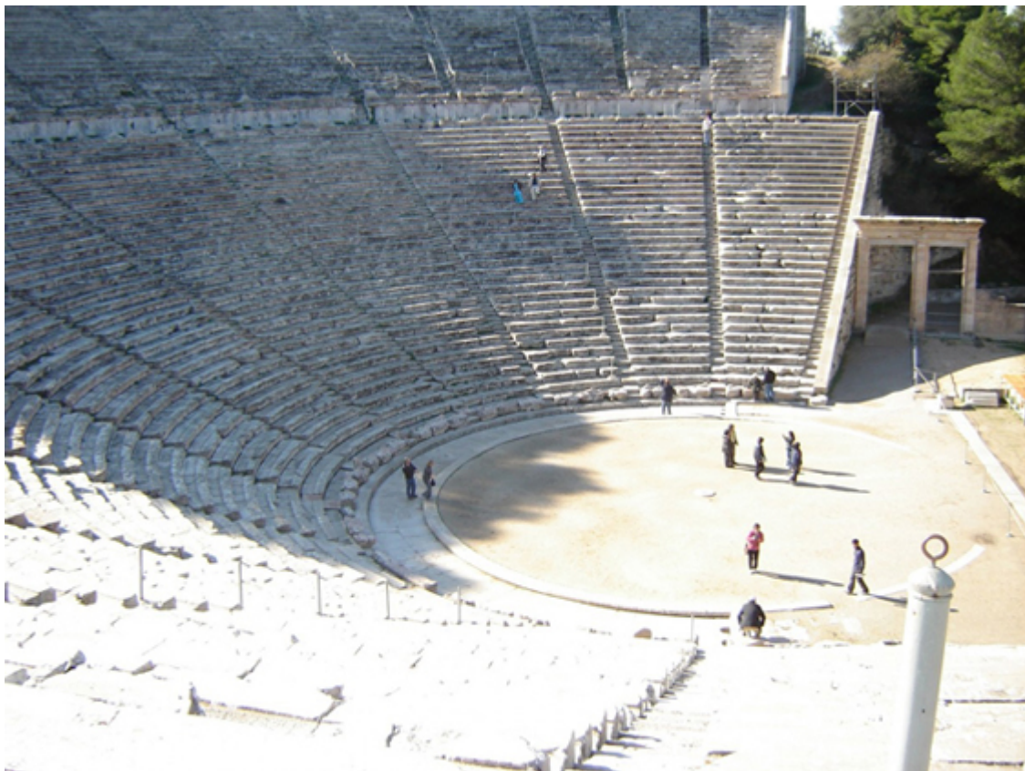
Amphitheatre in Epidaurus, Greece

Dear Members and Friends of ITI, dear Readers,