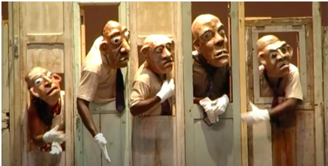
© Teatro Cenit, Nube Sandoval and Bernardo Rey, Colombia