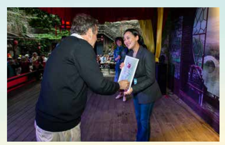
China Theatre Association

f the 70<sup>th</sup> Anniversary of the Vive ITI!