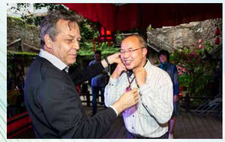
Shanghai Theatre Academy