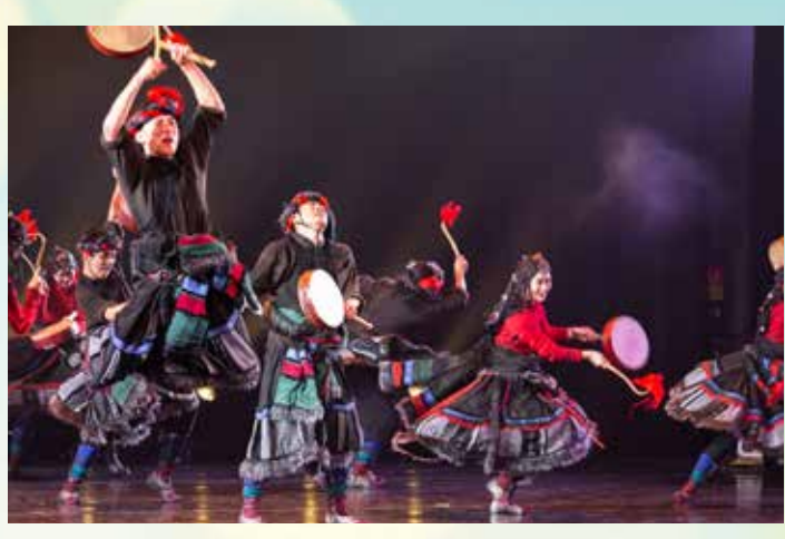
Every Corner of the World, Central Academy of Drama, China