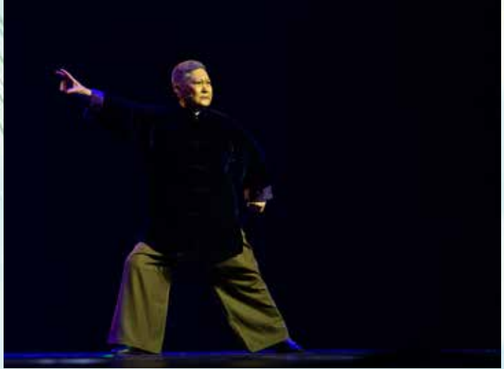
Kunqu & Jingju Opera: Lin Chong's Getaway at Nightfall & Cuiping Mountain, PEI Yanling, China