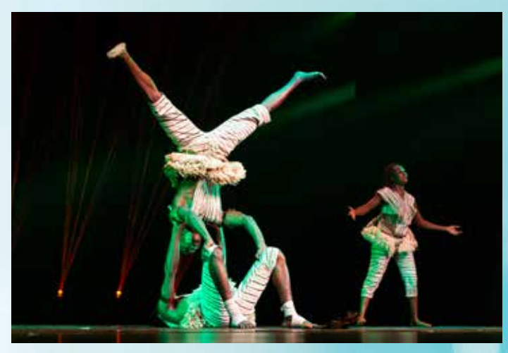
Traditional Dance: YAM-KA-NI, Burkina Faso