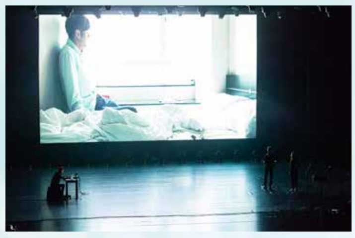
Enlightenment, Zurich University of the Arts, Switzerland

Finally, the Central Academy of Drama presented some dance drama's; one expressly modern, focussed on a young man losing his mobile phone, and others more traditionally orientated such as Every Corner of the World . This latter piece endeavoured to show that although people may live in different regions and in different contexts, they still yearn for the same sky.