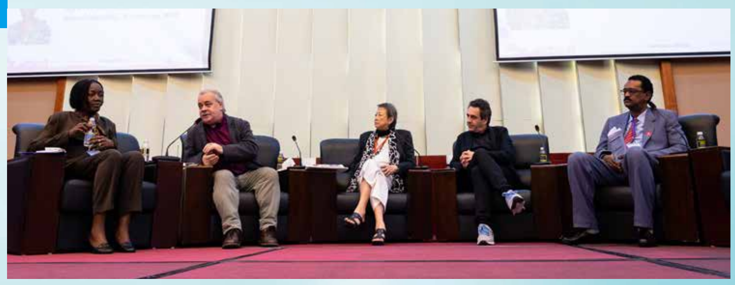
Round Tables 1: Performing Arts in Conflict Zones