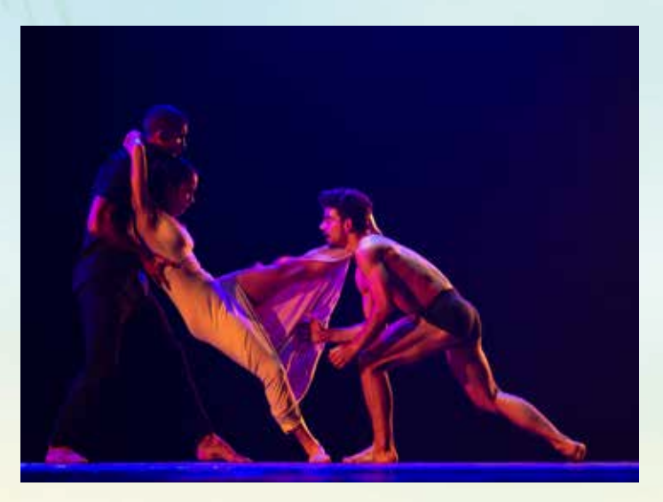
Contemporary Dance: Eden, Mi Compañía, Cuba