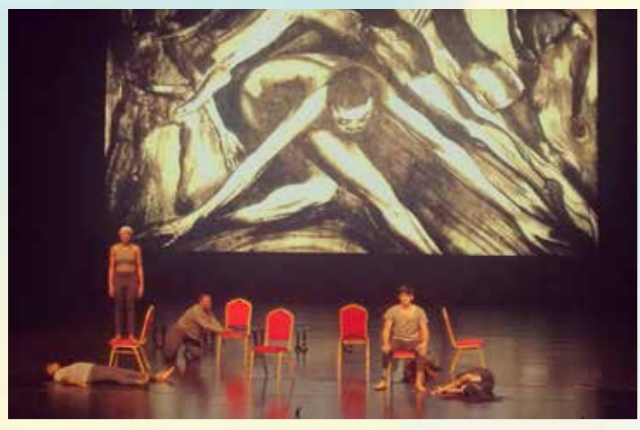
An African Story, University of Cape Town, South Africa