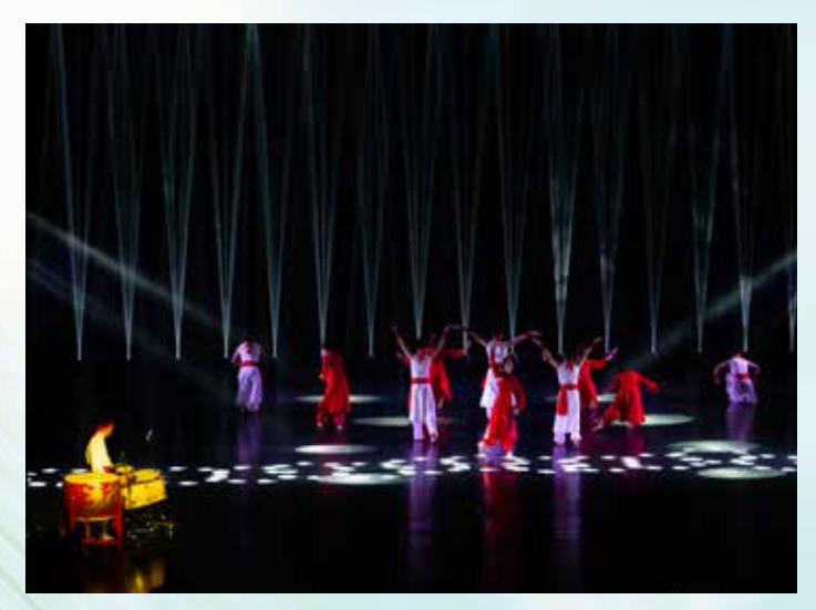
Opening: Dragons Flying and Phoenixes Dancing, Shanghai Theatre Academy Dancing College, China

This vision was reflected in the programme and setting of ITI Celebration Gala. The varied performances representing different countries around the world helped to show the joy of Chinese and world theatre to the international guests but also brought an exotic flavour to the people of Hainan. The Award Ceremony in the middle part of the performance commended those members and artists who have made important contributions to the development of ITI and thanked them for their hard work.