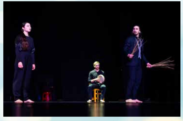
La Mouvaise Herbe, Accademia Teatro Dimitri, Switzerland

Through various theatrical art forms, these performances enabled the Hainan audience to understand the dramatic language and presentation methods of different regions around the world. It brought a grand feast to the audience from the visual and auditory aspects. Although some forms of drama may be abstract and obscure to local Chinese audiences, it is of great significance to cultivate and expand the audience group of performing arts in Hainan by letting the audience know the development status of the art in the world and the relationship between cultural background and artistic creation. At the same time, the performance of emerging artists shows the appearance of young people in the contemporary world. The support for emerging artists has far-reaching significance for the sustainable development of performing arts, which is the original intention of the education projects of ITI. Using a more novel and modern dramatic language to attract the participation of emerging practitioners can also improve the enthusiasm of young audiences, so that they can in turn be inspired to participate. It is also an effective means to promote Hainan's educational scene and benefit the public.