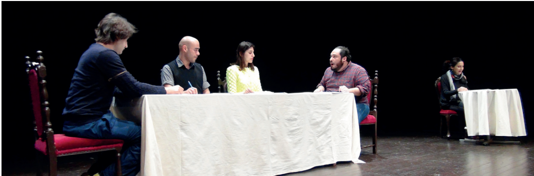
Play / Play On! Stage reading in the context of the project