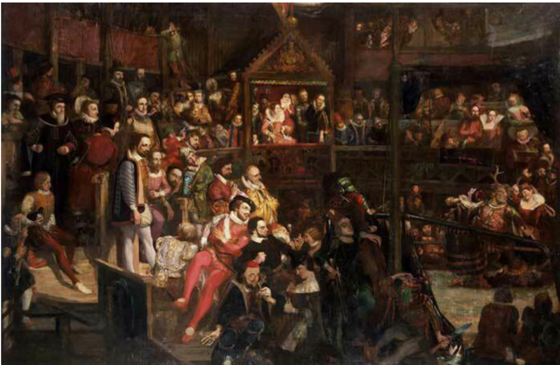
Queen Elizabeth viewing the performance of The Merry Wives of Windsor at the Globe Theatre, an oil painting by David Scott in the Victoria & Albert Museum collection, 1840

To make this issue public SIBMAS arranged an online petition at change.org: http://chnng.it/HFgsGKXdyy