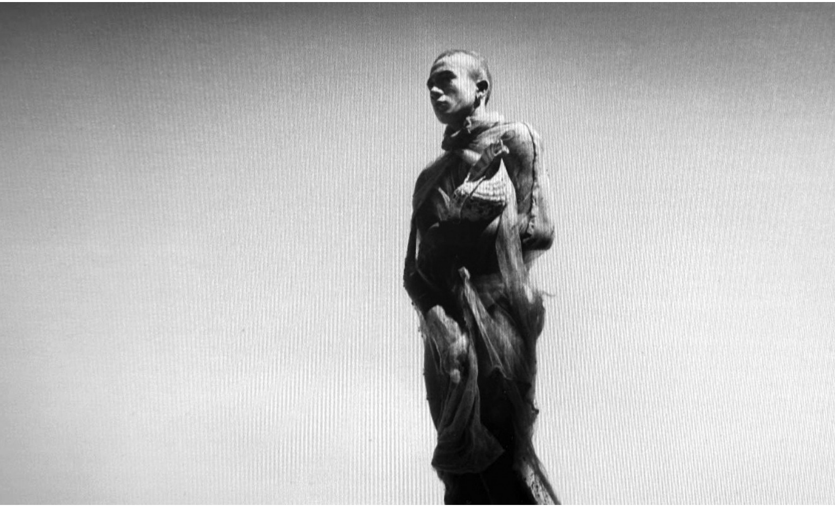
Lemi Ponifasio, Sea Beneath Skin , 2024, Luxembourg