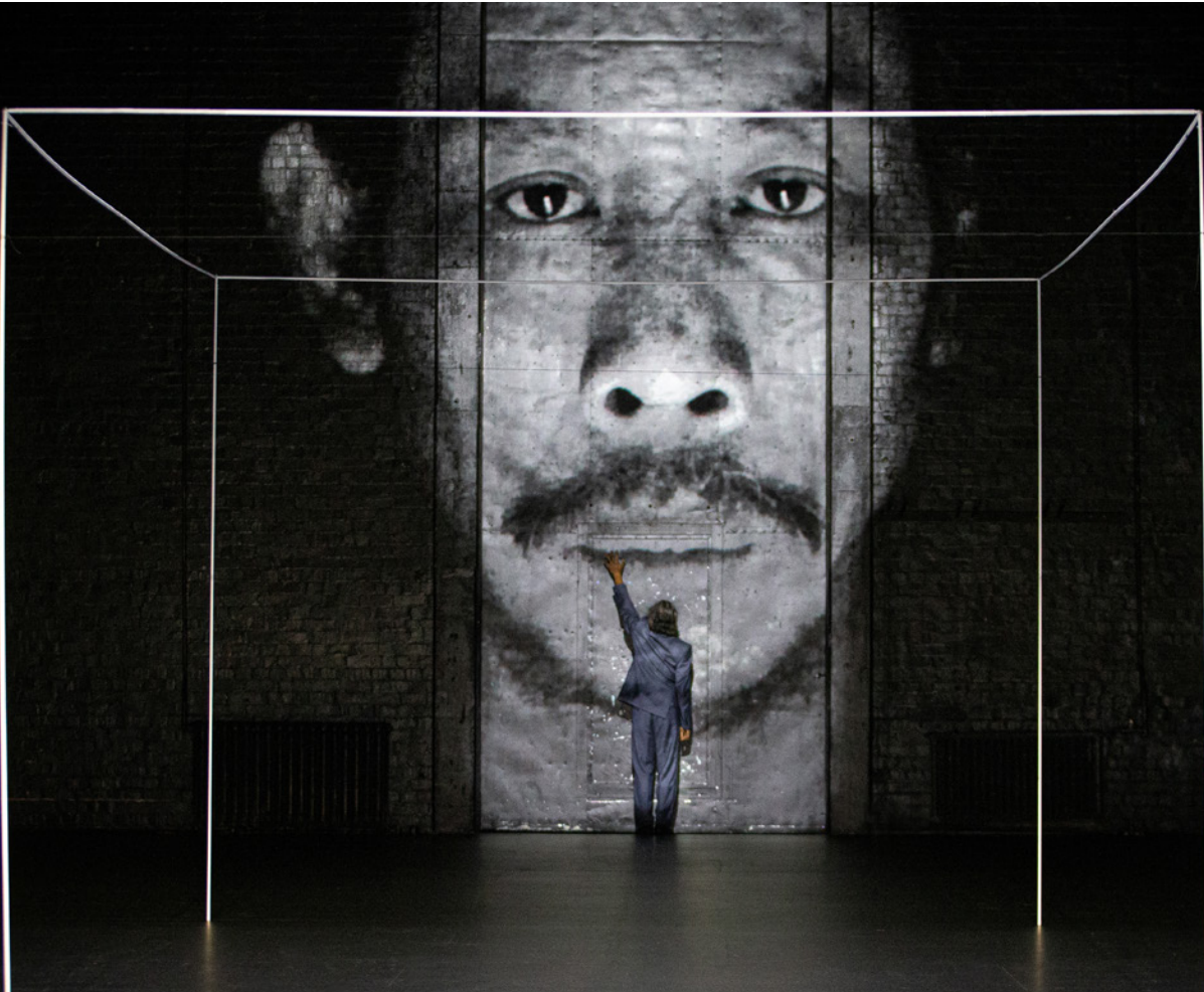
Lemi Ponifasio, A Time Between Ashes and Roses , 2023, Rome, Italy