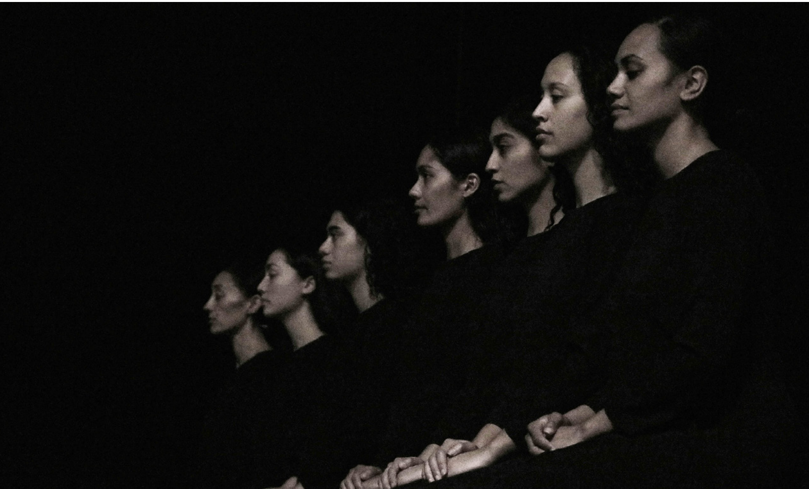
Lemi Ponifasio, Standing in Time , Festival d'Avignon 2017, Avignon, France