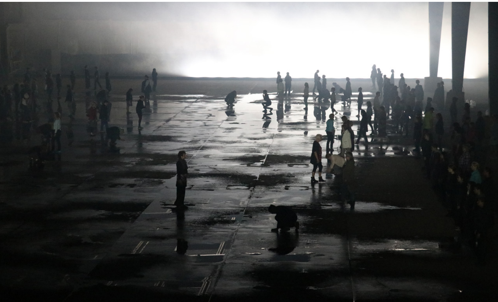
Lemi Ponifasio, Die Gabe Der Kinder , Theater Der Welt 2017, Hamburg, Germany