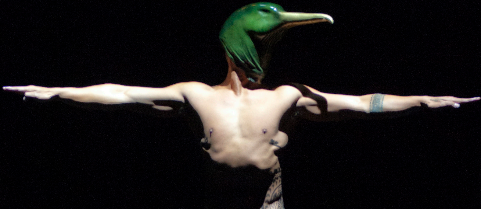
Lemi Ponifasio, Birds with Skymirrows , Edinburgh International Festival 2010, Edinburgh, UK