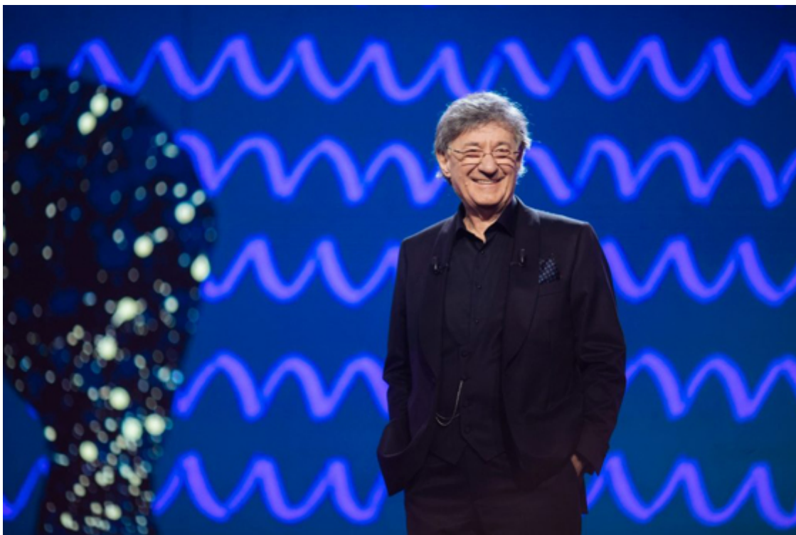
Ion Caramitru during the UNITER Gala 2020