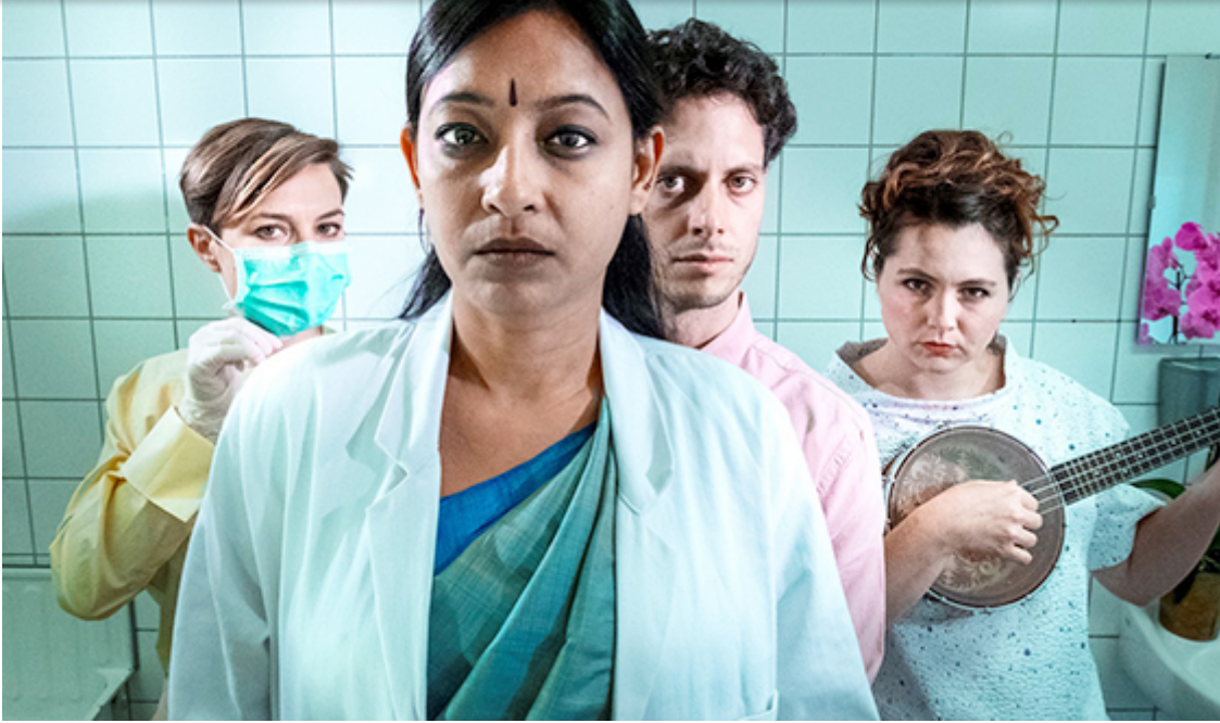
Flinn Works: Global Belly, Photo Credit: Alexander Barta