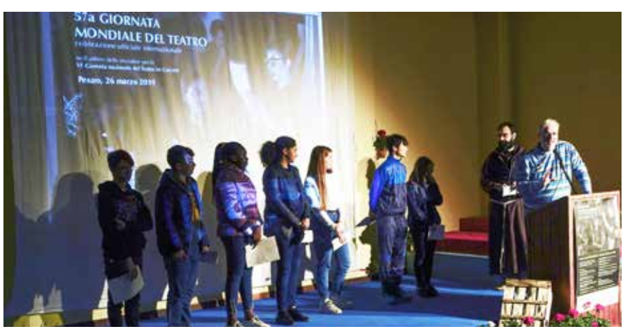
World Theatre Day 2019 in Pesaro, Italy