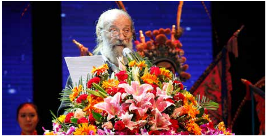
Anatoly VASILIEV, World Theatre Day 2016 in Guangzhou, China