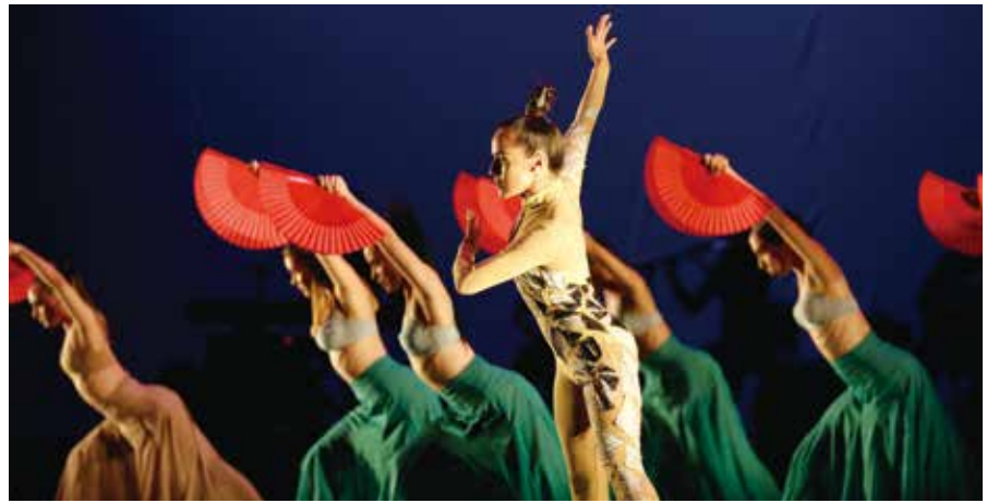
Ella y él... siempre by the Lize Alfonso Dance Cuba. International Dance Day 2018 in Havana, Cuba

The International Theatre Institute ITI created through its Dance Committee also International Dance Day.