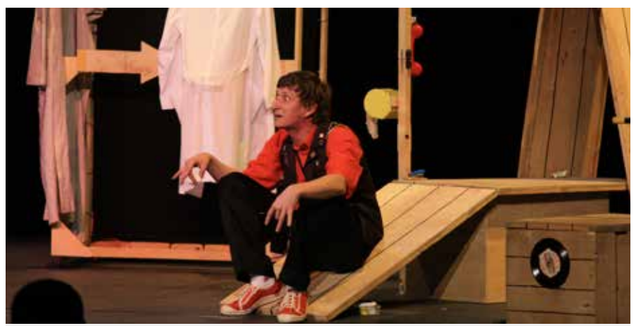
International Theatre Institute (ITI event in 2010)