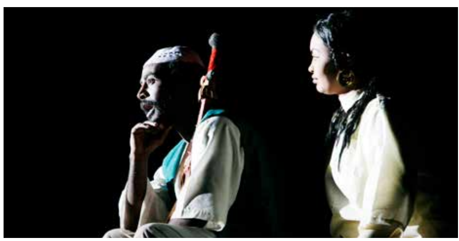
ITI Sudan Centre 2016

Due to the multitude of languages that exist all over the world, and because the Message should be understood by the people in a country or region, the Message of World Theatre Day is always translated into the country's language or languages and the same goes for the short biography of the author.