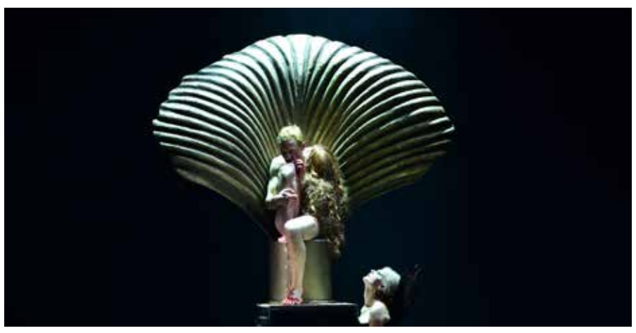
International Theatre Institute

World Theatre Day has been created by the International Theatre Institute ITI, the world's largest organization for the Performing Arts, and was celebrated for the first time on 27 March 1962.