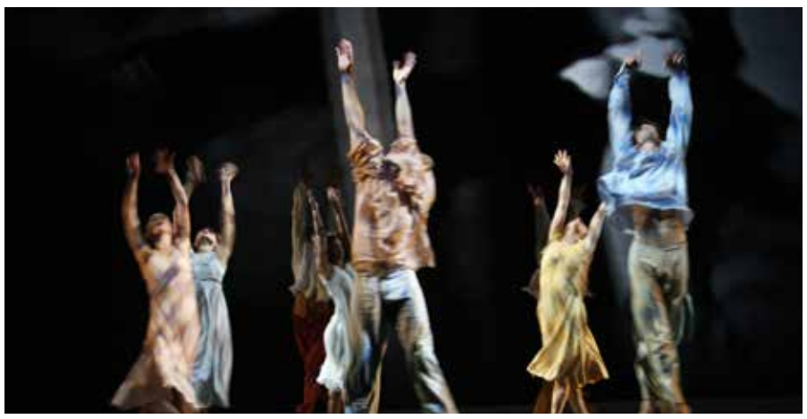
International Theatre Institute