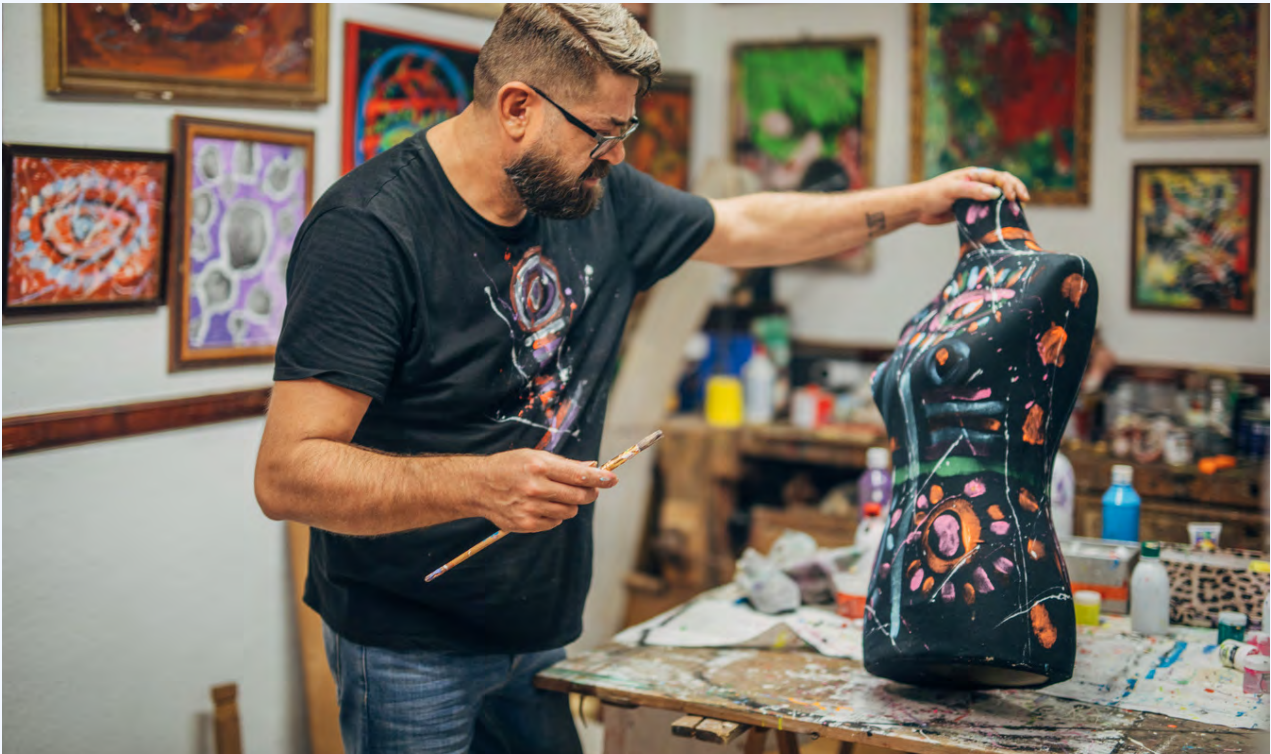
Hirurg, Getty Images Signature

Closed concert halls, museums, World Heritage sites, art galleries, cinemas, restaurants and theatres are emblematic of how the pandemic has affected the cultural sector and those working within it. In its latest report , the International Confederation of Societies of Authors and Composers (CISAC) estimates that its members will report losses of up to 3.5bn euros – an overall global decline of 20-35% – reflecting the clear threats to artists' livelihoods. UNESCO found earlier this year that museum professionals had also been hit hard, especially the self-employed, three out of five of whom had lost their jobs. A survey carried out by UNESCO on the impact of the pandemic on intangible cultural heritage revealed how many artisans' livelihoods were disrupted, often because they could no longer sell their products due to lockdown measures. The ripple effects of the COVID-19 pandemic on employment in the cultural sector expand far and wide, including to the tourism sector and auxiliary services, like the hospitality and food sectors, as well as the construction sector linked to the restoration of built heritage. The shutdown of the economy has shown how many jobs are linked to the cultural sector, directly and indirectly. Indeed, the pandemic has exposed the flaws and vulnerabilities across the current global economic system.