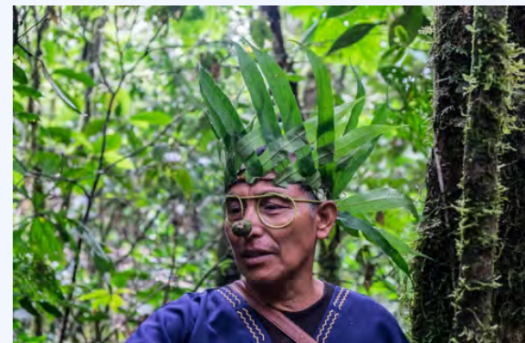
Borders of Adventure

The Government of Ecuador , through the Ministry of Culture and Heritage, will allocate USD 250,000 to support artisans and bearers of knowledge in the Amazon territory . The Development Plan for the Promotion of Social Memory and Cultural Heritage aims to reactivate, maintain and generate innovation processes in the value chains of cultural heritage practices in the field of crafts and agri-food heritage, affected by the COVID-19 pandemic.