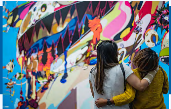
University of Melbourne Research

The Centre for the Promotion of the Arts of Finland has released " Art! The Handbook on Cultural Well-being ". The handbook, the first of its kind to be published in the Finnish language, is a practical information package that aims to help artists, social and health care professionals as well as decision-makers to succeed in cultural well-being work.