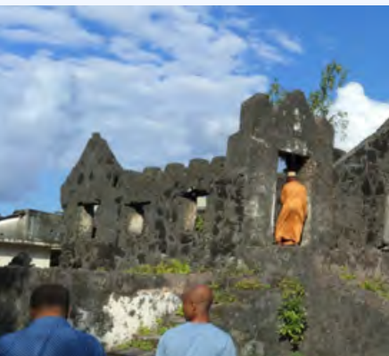
Karalyn Monteil, UNESCO

Comoros has begun work on a sustainable tourism management plan and implementation strategy due to be finalized in 2021. The process started with a UNESCO-led capacity-building workshop held in November, which mapped out the country's cultural and natural heritage resources. The project, financed by the Netherlands, includes supporting the national team to prepare a UNESCO World Heritage nomination file, as well as to train local tour guides.