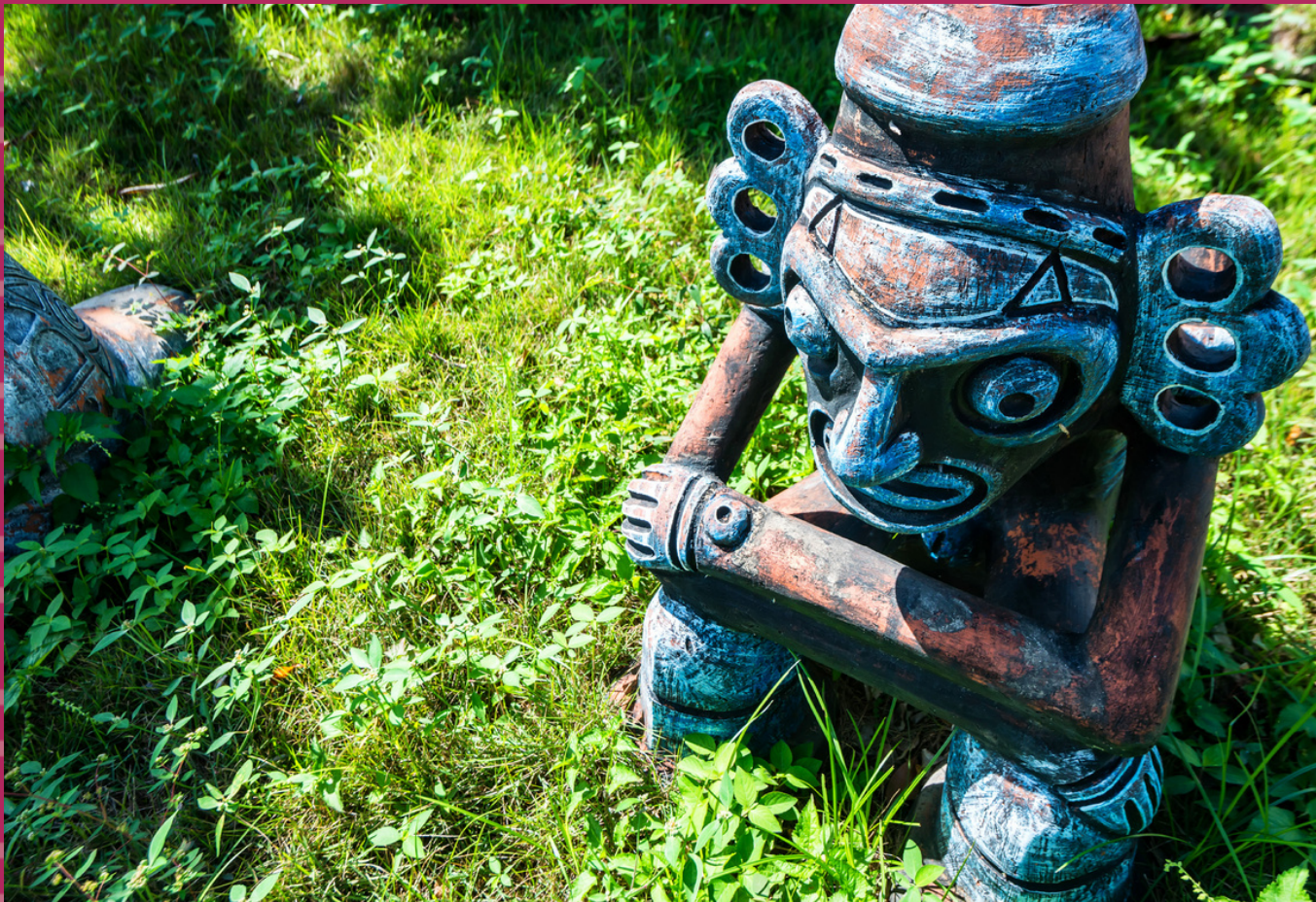
Taino Idol.

The Organization of Ibero-American States (OEI) on November 4-5 commemorated the 15th anniversary of the Ibero-American Cultural Charter . The commemoration, held in Montevideo (Uruguay) during the Ibero-American Congress of Culture, aimed to review the instrument and reaffirm its objectives, priorities, and challenges for the years to come. The Secretary-General of the OEI also highlighted the recent report " The contribution of culture to economic development in Latin America ". With the launch of this Charter, the value of culture as a vital pillar of social and economic development was recognized for the first time in Ibero-America whose population of almost 700 million people is among the most culturally diverse in the world.