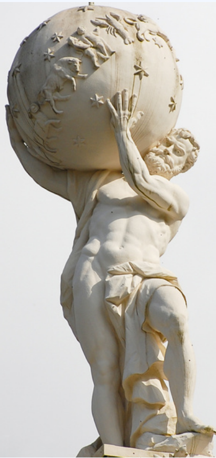
God Atlas from ancient Greek mythology

“ In the face of global fractures, and the paralysis of some institutional platforms, [culture] is a common language that breaks down barriers, ” declared the Director-General of UNESCO, Audrey Azoulay, while opening the 2019 UNESCO Forum of Ministers of Culture . The 130 ministers present agreed: now is the time to fully harness the power of culture to drive forward progress towards achieving a more sustainable future for all, tackling contemporary fault lines, from social fragmentation to climate change, from uneven distribution of emerging technologies to new conflicts. They recognized that the cultural sector – more than any other policy domain – has the capacity to adapt its models across time, building on the dynamic essence of culture itself.