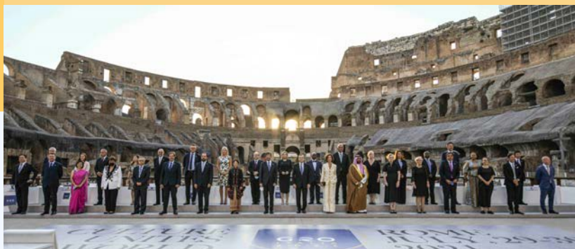
G20 Leaders' Summit Final Declaration, October 2021

“ Recalling that culture has intrinsic value, we underline the role of culture and of cultural and creative professionals and businesses as drivers for sustainable development and in fostering the resilience and the regeneration of our economies and societies, stressing the importance of international efforts to safeguard and promote culture, with a key role to be played by UNESCO... ”