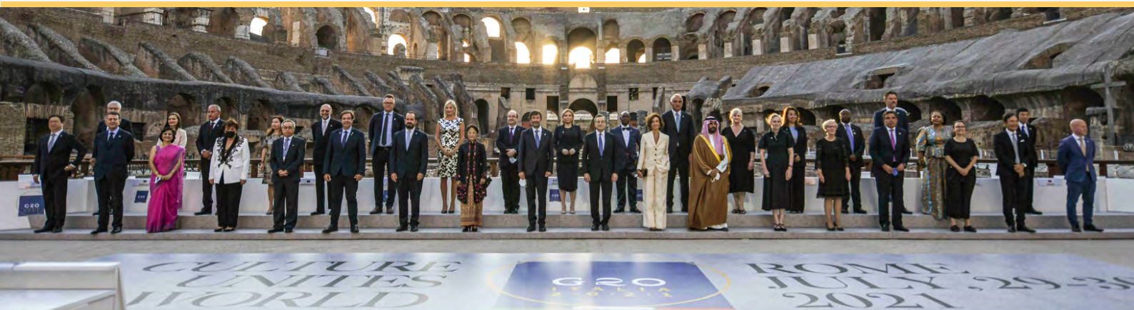
Massimiliano De Giorgi - G20/PCM Italian Ministry of Culture and G20 Italy

AT A GLANCE • CULTURAL POLICY HIGHLIGHTS • CUTTING EDGE • REGIONAL PERSPECTIVES SPECIAL REPORT • FIND OUT MORE