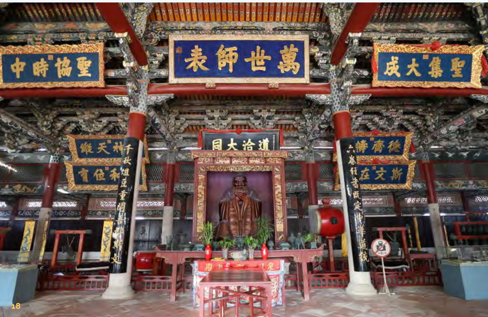
Interior of Dacheng Palace Hall, of the World Heritage site China, Quanzhou: Emporium of the World in Song-Yuan China

In the globalised world, the modern State is resolutely and irreversibly multicultural. To ensure unity in diversity and avoid social fragmentation and tensions, public policies must build inclusive societies – embracing the diversity of all citizens regardless of race, origin and gender – while ensuring respect for human rights and fundamental freedoms in a democratic environment. Institutional developments at country-level over the past decade – including new ministries of culture and the protection of cultural diversity in legal documents, such as constitutions – bears witness to this aspiration of many societies. Therefore, it is imperative for the State to guarantee respect for cultural diversity by designing policies that valorize cultural diversity as a positive resource for progress and not instrumentalised to sow division.