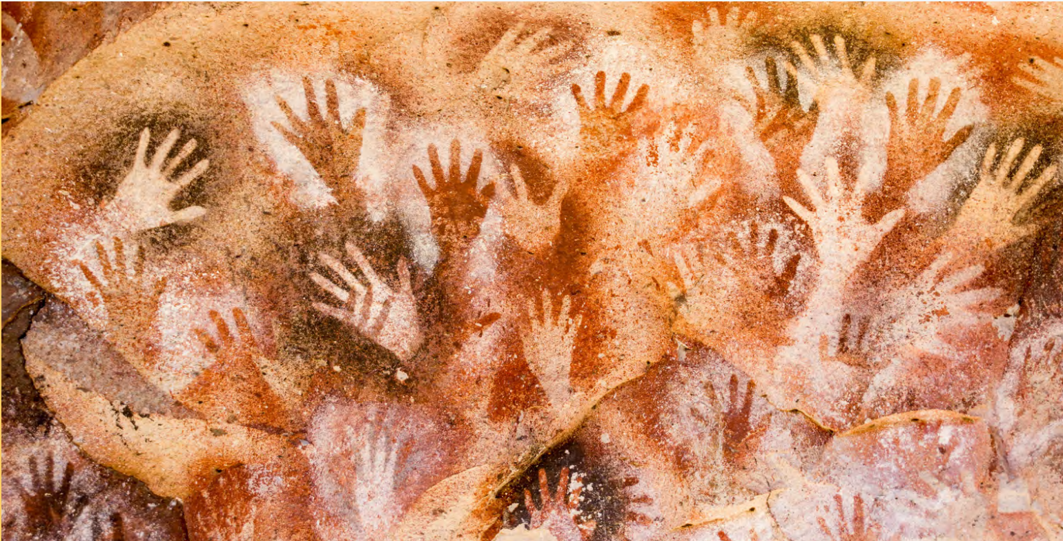
World Heritage Site of Cueva de las Manos, Río Pinturas, Argentina

Culture, in all its diversity, is an infinite reservoir from which we gain our knowledge of the world and which we tap into to find solutions to contemporary issues. Ever since the emergence of Homo Sapiens, human progress has evolved thanks to cultural diversity, through the exchange between human groups of discoveries and innovations, institutional experience and knowledge. Culture is in constant flux, evolving across time and space, adapting to the circumstances of the day. Each culture is therefore rich with insights provided by this vast accumulation of knowledge. Our cultural diversity is our greatest strength. It is the ultimate renewable resource for humankind and societies. As such, valuing diversity and protecting and promoting cultures as asset for societies is imperative.