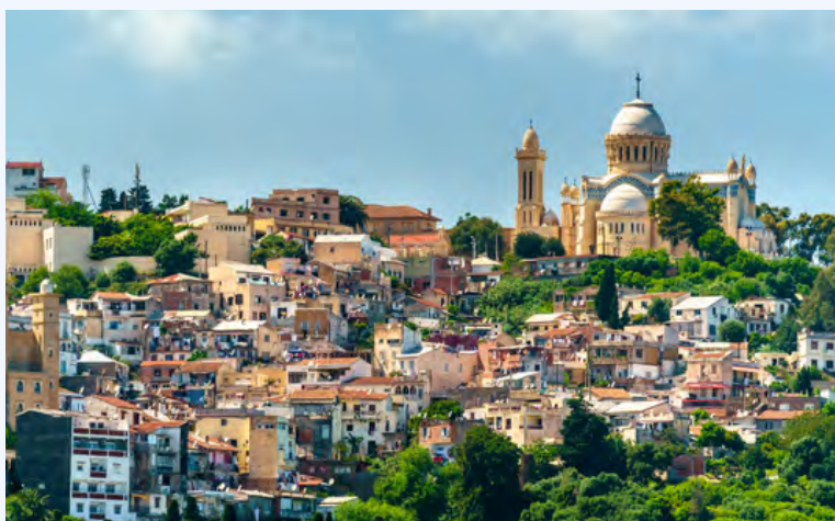
View of Notre Dame d'Afrique, Roman Catholic basilica in Algiers, Algeria

The Ministry of Culture and Arts of Algeria has announced a fund to support public or private specialized institutions or cultural associations for projects to modernise national museums, to maintain or restore cultural property or for awareness-raising activities that promote civic awareness and the culture of protecting and preserving cultural heritage.