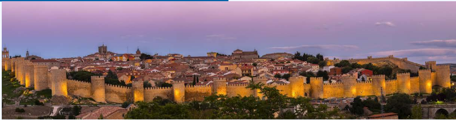
Panoramic view of the historic city of Avila, Spain, with its famous medieval walls surrounding the city. UNESCO World Heritage Site.