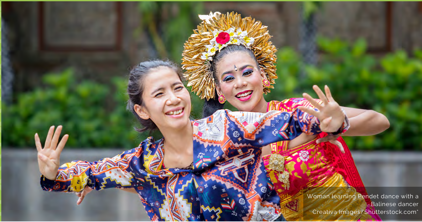
Woman learning Pendet dance with a Balinese dancer

Echoing broader priorities on culture, some participants during the Asia and Pacific Regional Consultation called for education systems that nurture physical, mental, and spiritual well-being. Therefore, culture and arts education should be a key component in creating a conducive environment to unlock the potential of each learner. Furthermore, the Asia and Pacific region places great emphasis on the preservation and safeguarding tangible and intangible cultural heritage, and recognizes that education is key to ensuring development long-term strategies. Of particular concern is ensuring appropriate mechanism for the inter-generational transmission of traditional knowledge for ecological resilience. In terms of strengthening intersectoral cooperation between culture and education, some participants put the emphasis on cultural heritage, traditional knowledge and even bio-cultural diversity as areas to reinforce. The commitment to equity for Indigenous peoples and local communities through reinforcing cultural rights underpins the region's approach. As promoting sustainable cultural tourism is a priority in the region, improving technical and vocational education and training is also a priority.