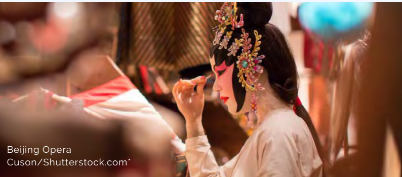
Beijing Opera

In Morocco , the House of Representatives has established the Moroccan Copyright and Neighbouring Rights Office , aimed at modernising its management methods, improving governance in the collection and distribution of authors' rights.