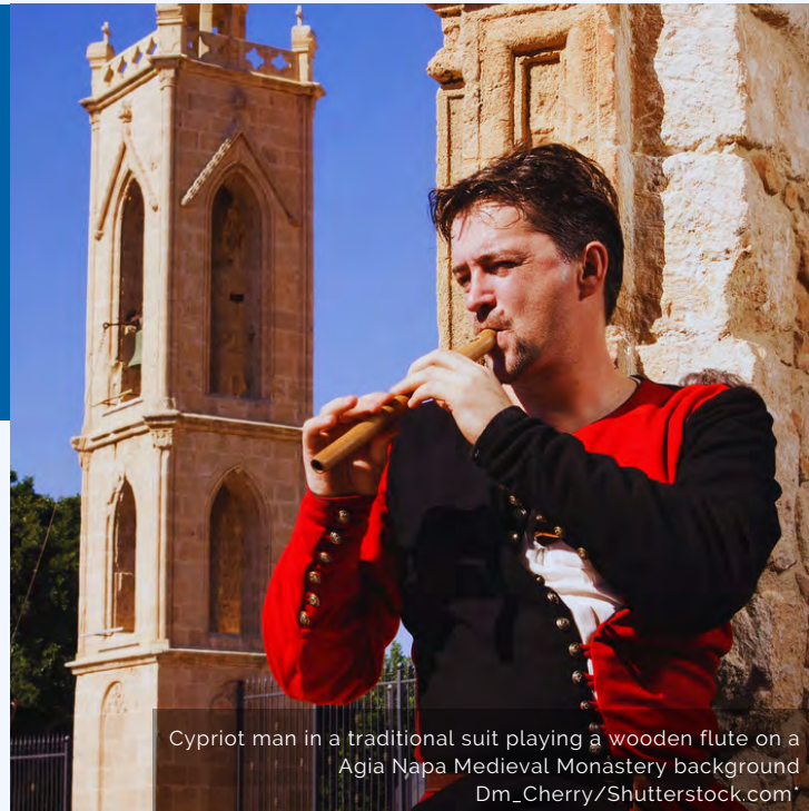
Cypriot man in a traditional suit playing a wooden flute on a Agia Napa Medieval Monastery background

Cyprus has for the first time established a Ministry of Culture , whose responsibilities include promoting Cypriot cultural identity through cultural heritage and modern creation, the development of infrastructure and cultural institutions and strengthening the professional status of those working in the cultural and creative sector.