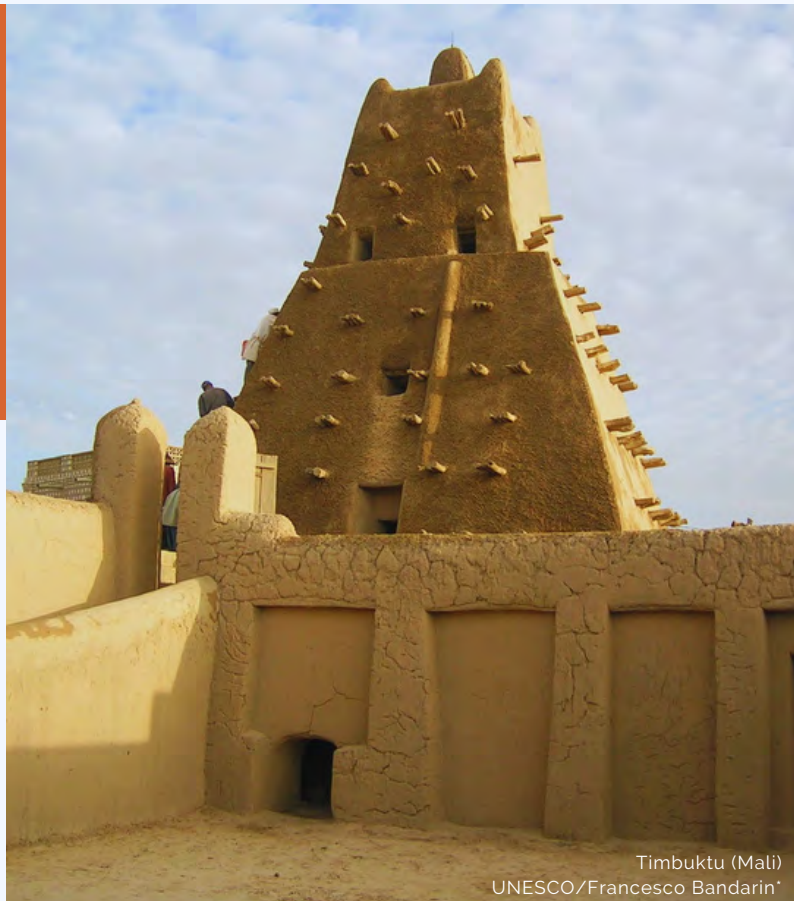
Timbuktu (Mali)

The movie theatres of Paraguay and the production company Janus Media SA have joined forces to carry out a study on "Evidence-Based Cinema" that consists of systematizing data to analyze the cinematographic preferences of the local audience, commissioned by the National Secretary of Culture.