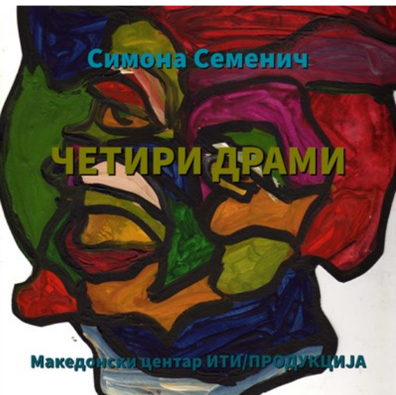
4 ePlays by Simona Semenic (Slovenia)