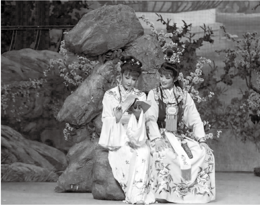
■ Dream of the Red Chamber

The playwright Xu Jin extracted a clear clue from the novel: the love story of Jia Baoyu and Lin Daiyu, and naturally including Jia Baoyu's mischievous behaviour. The Yueju version longed for free love. Jia Baoyu and Lin Daiyu were rebels of the old days and were incompatible with the surroundings. With the development of the plot, it imputed the tragedy in the class oppression nature of ritual law. Besides the theme of resisting the old social system, and thus the Yueju Dream of the Red Chamber , also acquired its political legitimacy.