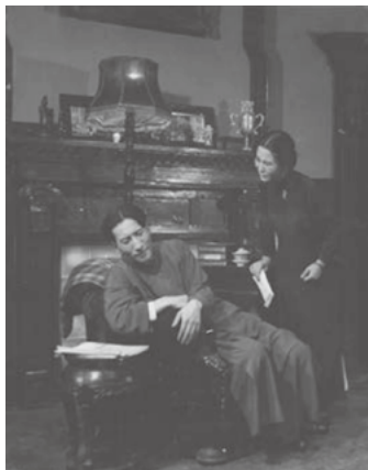
■ Thunderstorm , 1954

Thunderstorm , a four-act play, looks to the three unities to provide the foundation for expounding a complex story involving family hierarchies, adultery, incest, threatened murder and labour unrest. The relationships between masters and servants, as