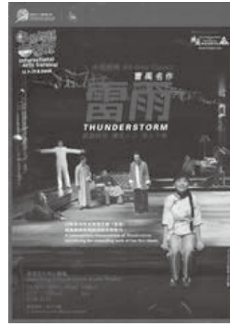
■ Thunderstorme , 2008

literary arts have been too particular about ‘use’ for a long period. Why cannot we create cosmopolitan works? This is a thought-provoking question.” 1