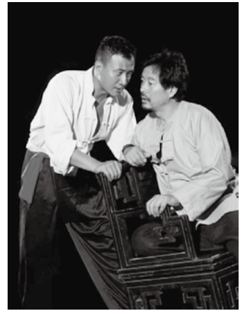
■ The Wilderness , 2010

expressing Shakespeare's thoughts and feelings, he combines the real society with it to explore the possibility of infinite expression. In 1990, Pu Cunxin starred in Hamlet for the first time (directed by Lin Zhaohua), and the Hamlet acted by him was melancholy, contradictory and neurotic. As a young actor with little experience then, his performance at that time was commendable, but it was not beyond expectation. In 2018, nearly 30 years later, Pu Cunxin again performed in Hamlet (director Li Liuyi). This time, he played the greedy and vicious Claudius. The change of roles was full of freshness for Pu Cunxin. This performance made him take a big step forward in exploring Shakespeare.