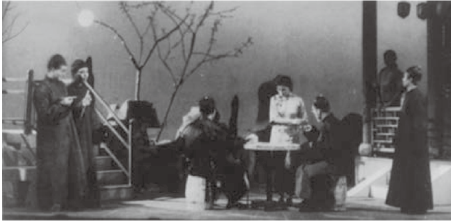
■ The Family , 1948

to test them. He not only stripped away the purity on the surface and interrogated the evil hidden underneath, but also tortured the purity hidden under the sin. He also refused to let them die easily and tried to keep them alive for a long time. Dostoevsky seemed to be distressed together with him, and happy with the interrogator. This is by no means something that ordinary people can achieve. In short, it is because of greatness.” 1 Lu Xun's description of the aesthetic features of Dostoevsky's novels also in a sense, reflected the tendencies of his own creative psychology. Cao Yu, like Lu Xun, was also a great writer with a deep sense of self-directed cruelty.