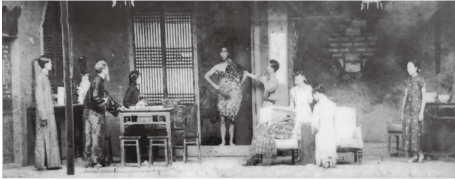
■ Peking Man , 1942

theatre with his stepmother in childhood, and Tianjin Nankai High School, where he studied, was the cradle of modern Chinese theatre movements. The school had excellent artistic atmosphere, experienced instructors, a formal theatre association and abundant performing practices.