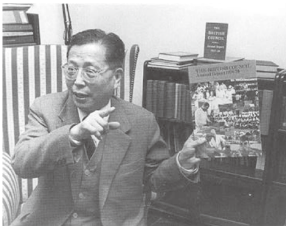
■ Cao Yu visiting the British Council, 1980

profound feeling about the novel of The Family is the resistance to feudal marriage and the pain unfortunate marriage brought to young people.” 1 Even in the adaptation, Cao Yu still attached great importance to his personal experience and wrote based on his own feelings and perceptions, besides his attention to differences of literary forms. This was his experience.