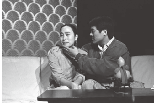
■ Lady Leftover , 1993

styles, the "gang" drama club led by Meng Jinghui has performed absurd dramas such as Elevator , The Bald Soprano , Balcony , etc. pursuing a "distinctive form and avant-garde consciousness that can tell it apart." Additionally, Lin Zhaohua persevered in creating experimental works. His important works of this period include Hamlet , which "deconstructed" the nobleness and solemnity of Shakespeare's original works ruthlessly.