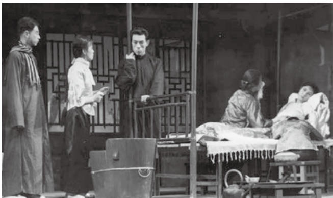
■ The Family , 1954

I remember it was in 1942 during the steaming hot days in Chongqing. I wrote The Family on a boat anchored in the Yangzi River...The crew