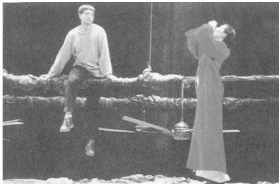
■ Spoken drama Hamlet , 1989

Pu Cunxin, whose father was an actor and director of Beijing People's Art Theatre, was born in 1953 in Beijing. He grew up in a special period when he experienced life in Beidahuang (the Great Northern Wilderness in northern China). In 1977, Pu Cunxin