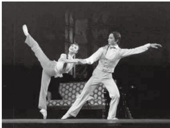
■ Thunderstorm , 1981