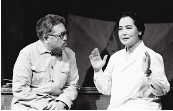
■ Metamorphosis , 1987

Superficially a story of a peasant's revenge, it interweaves darkness, nightmare, fear and mystery in the style of expressionist theatre. The heart of the play remains the playwright's philosophical obsession with fate and cosmic cruelty. While the plot relates the protagonist's deliberation, preparation and execution of his vengeance, and his consequent feelings of guilt and eventual suicide, dramatic colour is added through the rivalry for exclusive affection between a possessive old mother and a beautiful but jealous wife, as well as the primitive passions, sexual deprivation and defiant courage of life in this remote environment. The Wilderness has thus afforded rich opportunities for adaptations into film, Western opera, Peking Opera (or Jingju) and other regional theatres.