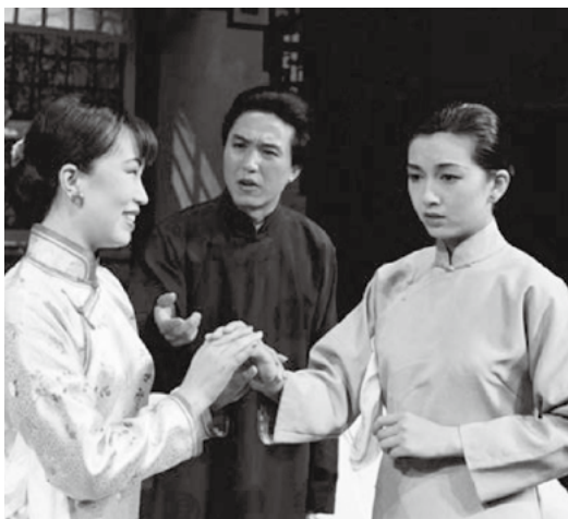
■ Peking Man , 1990