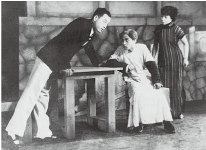
■ Molière's The Miser re-written and acted by Cao Yu (right), 1935

In 1930, he gave up his study of politics, and entered the Department of Western Languages and Literatures at Tsinghua University in Beijing. At the age of twenty-three, he completed his first work: the ground-breaking spoken drama Thunderstorm , which was published in 1934. Chinese students in Tokyo performed a Japanese translation in 1935 before the play's professional premiere in China later that year. Thunderstorm became China's most important modern play and established the prestige and popularity of spoken drama in the 1930s. Over the next ten years, Cao Yu's playwriting flourished in spite of the disruption of the Second Sino-Japanese War, and his plays gained international recognition being staged in many cities including Moscow and Tokyo. In 1946, invited by the U.S. State Department, Cao Yu, along with novelist Lao She, lectured in the United States.