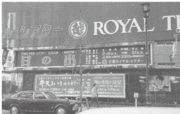
■ Sunrise , 1981

For thus the way of God Cuts people down when they have had too much And fills the bowls of those who are in want. But the way of man will not work like this: The people who have not enough are despoiled For tribute to the rich and surfeited.