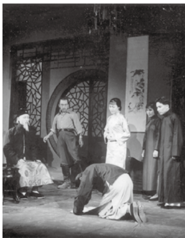
■ Peking Man , 1957

In Peking Man , considered by many to be his masterpiece, Cao Yu returned to his original style of drama concerned with human beings and their poignant relationships. Written with a sense of poetry, this three-act play objectively presents the decline of a once-prominent scholar-official family and fiercely attacks the tensions and hypocrisy of the Chinese gentry: the “good-for-nothing” members of the polite society of the time.