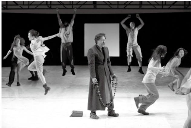
■ The Tempest , 2018

and development. People engaged in artistic creation should pay attention to their own cultivation, including learning in life, self-cultivation and self-discipline. In addition to his work, Pu Cunxin has also done a lot of public welfare undertakings. He not only works by himself, but also introduced his family and friends to do it together. In his opinion, there is no end to being a human being, just as there is no real end to art.