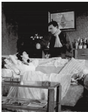
■ Sunrise , 1956