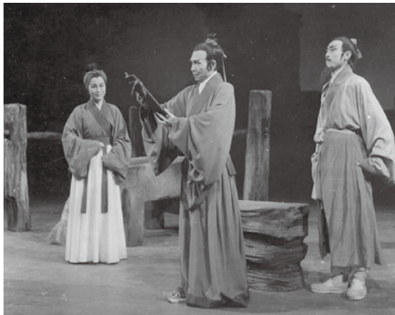
■ Courage and the Sword , 1961

By the late 1950s and early 1960s China was a nation of young people, detached from the past and ready to compete with the outside world. At the same time, the country had experienced the greatest difficulties with its economy and international relations. Following the disastrous Great Leap Forward campaign, China suffered unprecedented famine, and the Sino-Soviet split exacerbated China's economic situation. "Self reliance and arduous struggle" was now the motto for the nation to follow; professionals in literature and arts were encouraged to produce works supporting the Party's