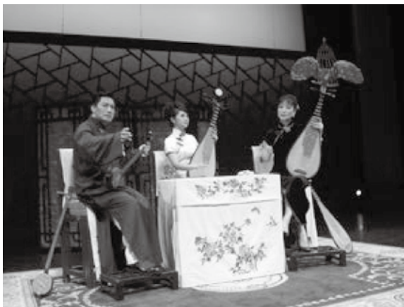
■ Thunderstorm , 2010

But she never got Zhou's love. The marriage was also not consummated. In despair and thirst of love and sex, she fell in love with young Zhou Ping. This thirst, capture and struggle for love and sex pushes forward the metamorphosis of the character relationship and the tragedy. Finally, the "cruelty and coldness of the struggle in the universe", borne in Cao Yu's mind constantly, burst out. 1