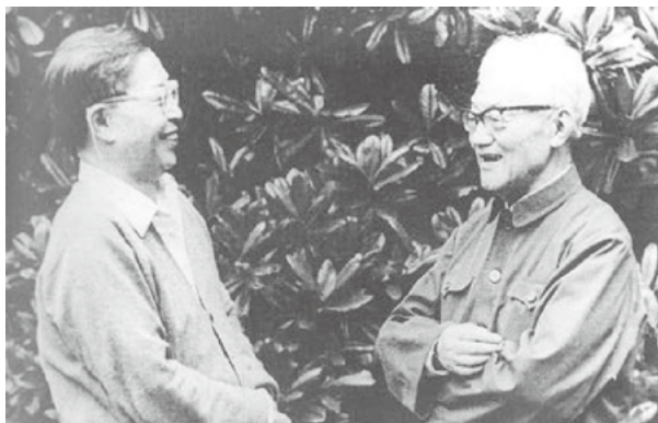
■ Cao Yu and Ba Jin in the 1980s

Cao Yu's own experiences, his father's early death, his family's decline, and his sister's tragic death all put a squeeze on his life, became the sadness in his soul and put him through the suffering mill of fate. Thus, in his consciousness, he naturally developed a sense of a nameless melancholy, questioning and reflecting on the meaning of existence and reasons for living.