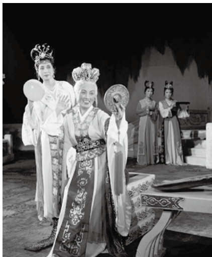
■ Consort of Peace , 1979