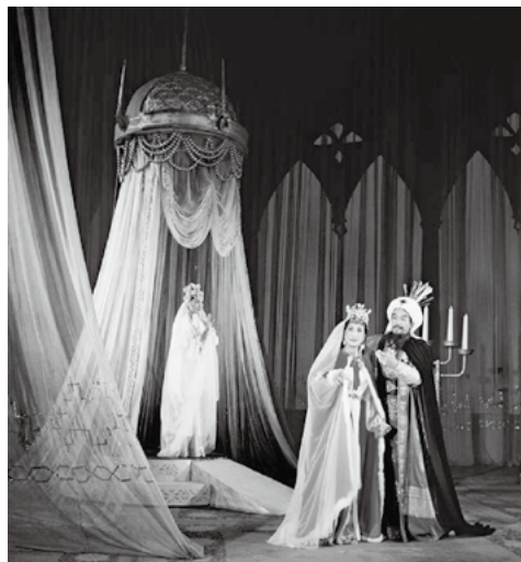
■ Consort of Peace , 1979

policy. Courage and the Sword was written and produced against this background.