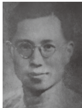
■ Cao Yu in 1940

The word "anxiety" originates from the Hindi word "angh", which is related to "narrowness" and "restraint". It is a typical psychological phenomenon, reflected in almost everybody but to different degrees. According to Verena Custer, "when we feel an accumulation of unpleasant excitement, we call it anxiety. Anxiety is a form of excitement that is unpleasant". 2 While modern anxiety in artistic thinking is also expressed to some extent in the