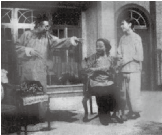
■ Thunderstorm , 1935