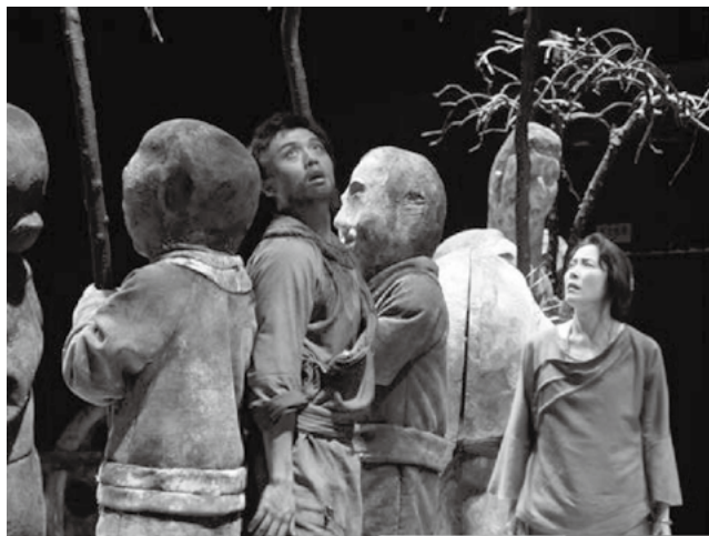
■ The Wilderness , 2005

the playwright switched the protagonist from Qiu Hu to Jinzi, enriching its social content and reflecting by a condensed revealing of Jinzi's fate. The storylines of Jinzi and Qiu Hu intertwined and echoed with each other, making Qiu's revenge more exciting and attractive.