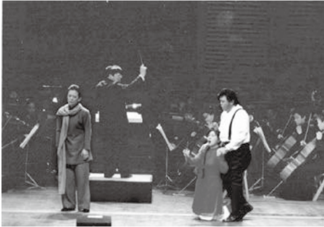
■ Thunderstorm , 2006