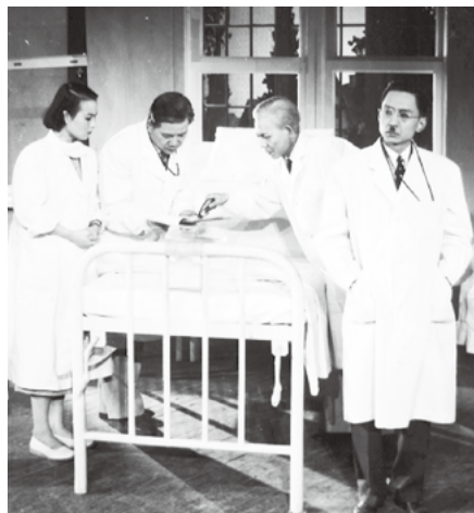
■ Bright Skies , 1954

members saw me hunched over a small table day and night, sweat rolling down on my bare back. A middle-aged man said to me: “Gosh! You really work hard writing your plays.” In my life, I’ve forgotten many things that I should have remembered, but this sentence, perhaps for the man’s sincerity, has lived in my mind ever since. 1