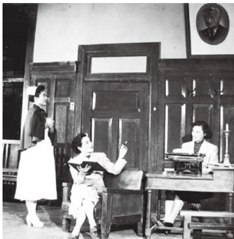
■ Bright Skies , 1954