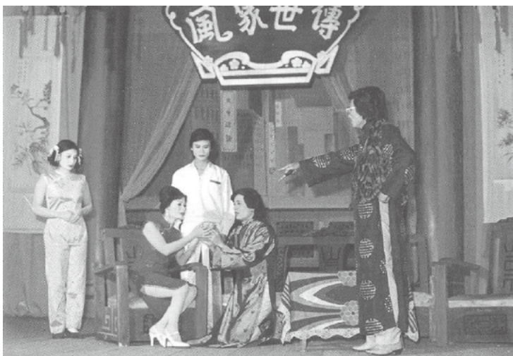
■ Thunderstorm , 1989

A mid-length Pingtan lasts two hours. It is impossible to copy a four-hour classical