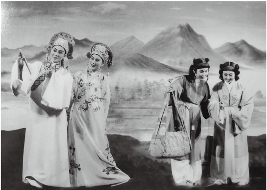
■ Liang Shanbo and Zhu Yingtai

Like a bird out of a cage, Zhu Yingtai was very happy for the temporary freedom and success offered by the men’s world, and was also curious about the coming student life. Tired on the road, she stopped in a wayside pavilion near a grass bridge, where she met Liang Shanbo who was also going to study in Hangzhou. Liang was refined,