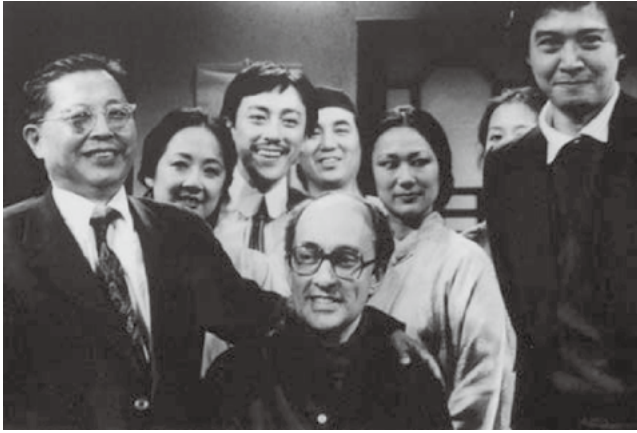
■ Peking Man , 1980

terror", "mystery of the wilderness", ghostly "strange and quiet", and full of "primitive cruelty" and the "terror of life". In the play, Cao Yu described Qiu Hu's situation as follows: "fear grasps his mind, and he is like his ancestor, the primitive ape man ... hope, recollection, terror, and resentment attack his imagination continuously, which makes his hallucinations suddenly and abnormally active. In the dark wilderness, we cannot find a trace of his 'ugliness'. On the contrary, we gradually find that he is beautiful and worthy of noble sympathy. He represents a real person who is oppressed by all kinds of things. The injustice he suffered is repeated in the forest. In the prelude, the cunning, evil and deceitful nature gradually disappears, just as Jinzi's torment in the middle of the night is sublimated into spirituality by the love of Qiu Hu's body". 1 This passage had been ignored by researchers in the past, but it shows the original intention of Cao Yu for Qiu Hu to become a "real person" of "beauty" after waking up from revenge and madness, and who is also sublimated to the existence of "spirituality". Here, the "primitive ape man", as the opposite of mechanical and institutional modernity, shows the resistance of human beings to the increasing separation of material and spirit, as well as the desire of human beings to find their lost selves and restore their souls. Therefore, the aesthetic modernity embodied by the "primitive ape man" is very clear.