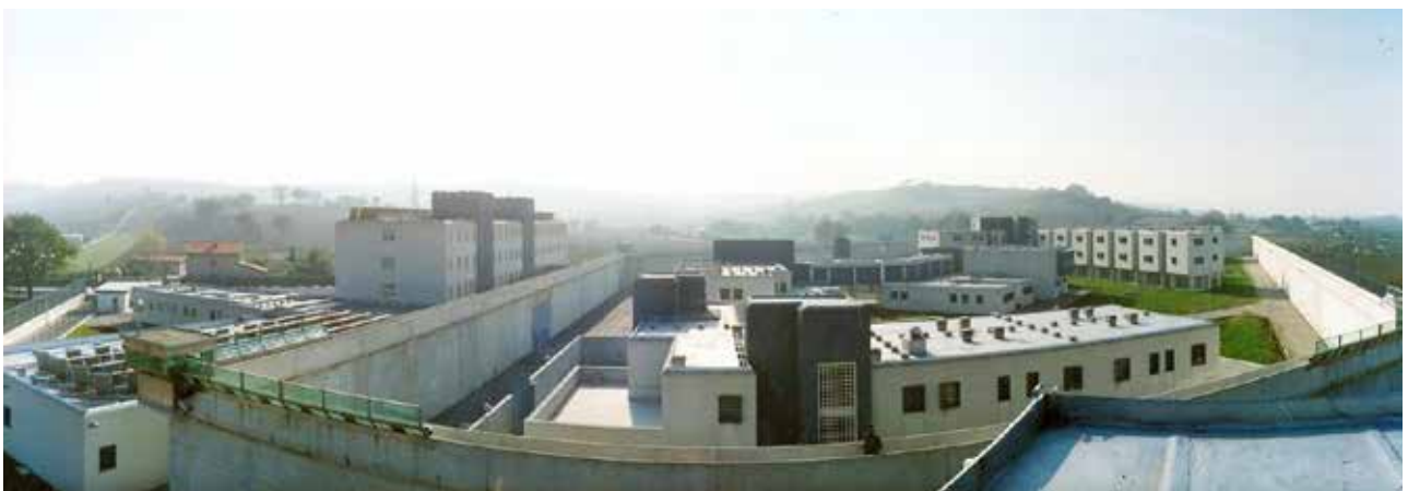
Prison of Villa Fastiggi, Pesaro