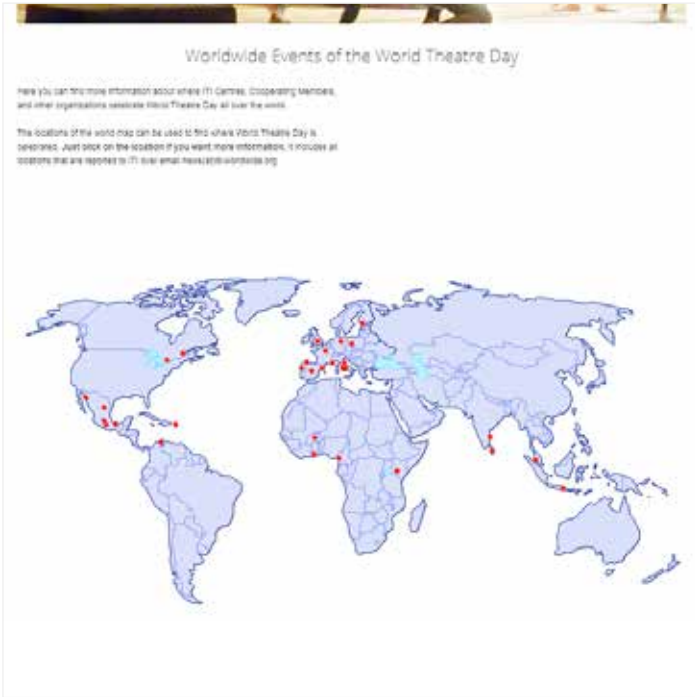
Website of the World Theatre Day Worldwide Celebration Virtual Map