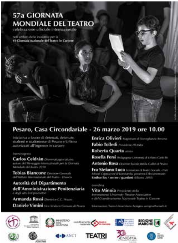
Poster of the event

For the World Theatre Day 2019 main event, the General Secretariat and the Italian Centre of ITI have selected a location and collaborations that underlined ITI's humanistic and educational commitment.