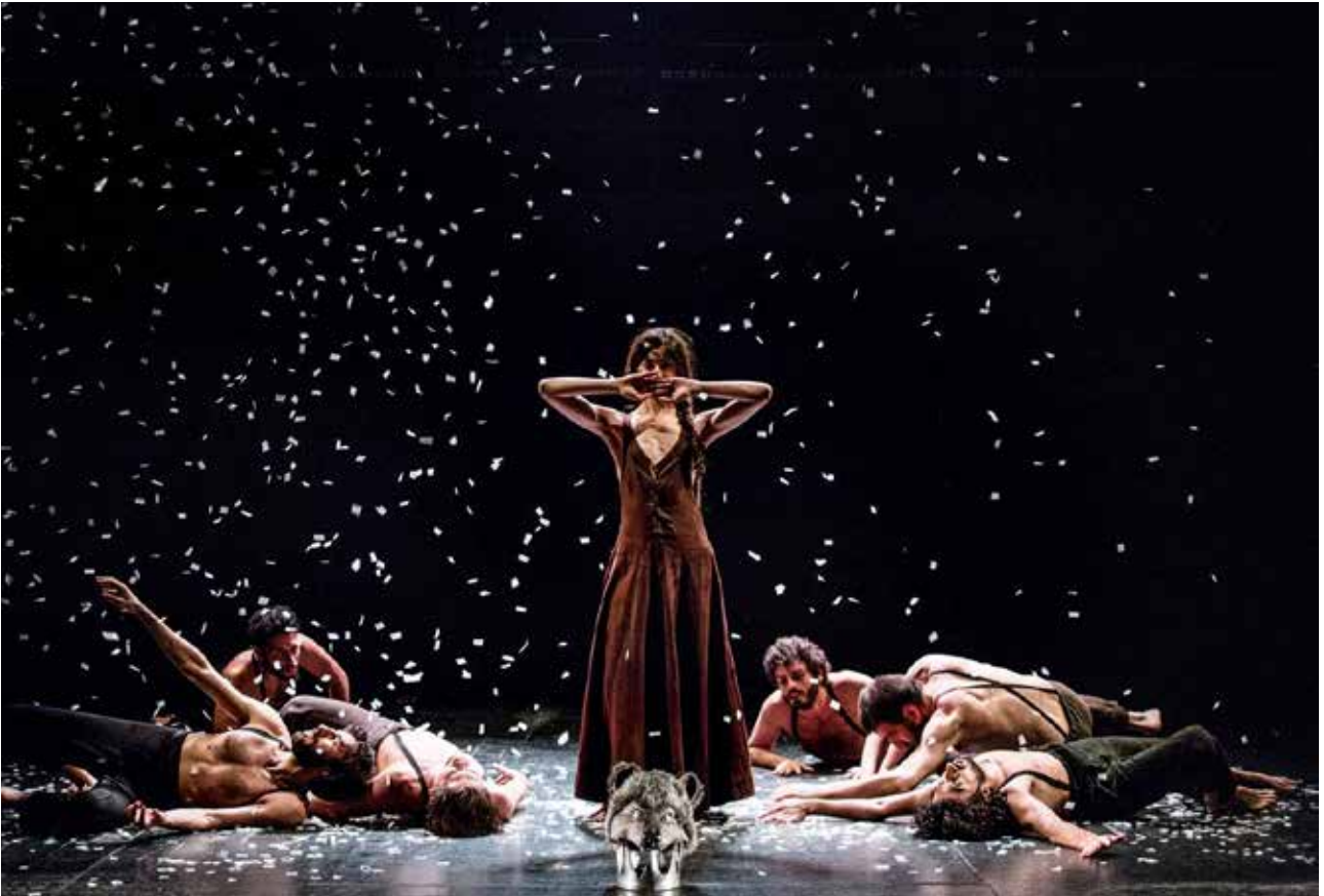
Evening performance: Abitare la battaglia