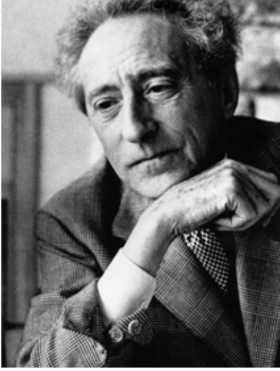
Jean Cocteau, France Actor, stage director, artist, film director, playwright and writer, the first World Theatre Message author (1962)

World Theatre Day was created by the International Theatre Institute and was celebrated for the first time on 27 March 1962, the opening of the "Theatre of Nations" season in Paris. Since then, every year on this date, World Theatre Day is celebrated on a global scale.