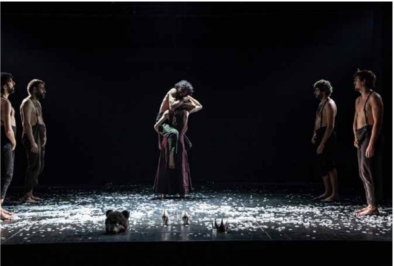
Evening performance: Abitare la battaglia